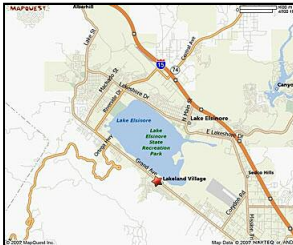
0.14 Acres Mapquest