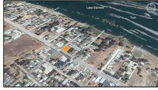
0.14 Acres Google Map