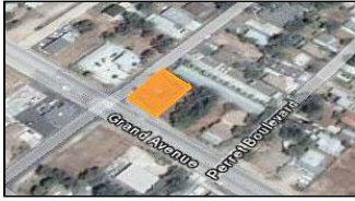
0.14 Acres Google Map Small