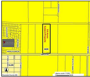
RCIP Land Use Map